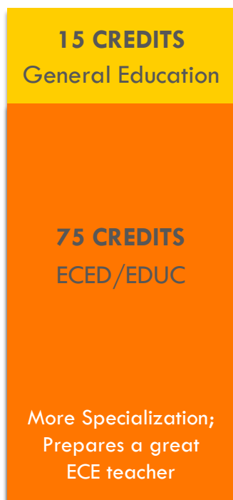
Technical Associate Degree (ATA)